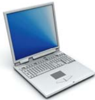
An example of the Fujitsu tablets being used at PW OB/GYN

In November of 2007, Prince William OB/GYN skyrocketed into the "information age" with its implementation of electronic medical records (EMR) . Our goal with the EMR is to improve patient safety and quality of care. You will see the staff and physicians carrying small "tablets" to enter medical information into our system. There may be