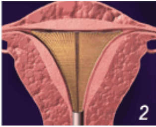
The Novasure wand inside of the uterine cavity.

“ONE IN FIVE WOMEN EXPERIENCE UNUSUALLY HEAVY PERIODS”